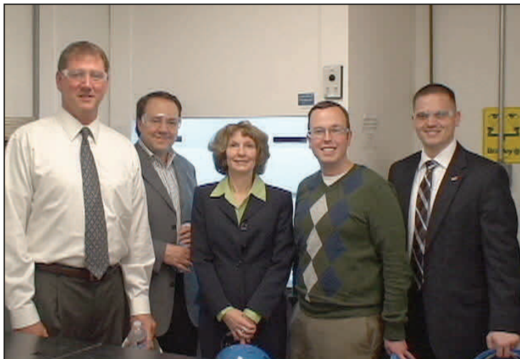
Congressman Pat Tiberi tours GFS Chemicals

SOCMA CONNECT also has an active Congressional site visit program. Earlier this summer, GFS Chemical welcomed Congressman Pat Tiberi (R-OH) to a tour of their inorganic manufacturing operations in Columbus, Ohio. In August, Hampford Research, Inc. had Congresswoman Rosa DeLauro (D-CT) tour their facility in Stratford, Connecticut. Both visits allowed the SOCMA members uninterrupted