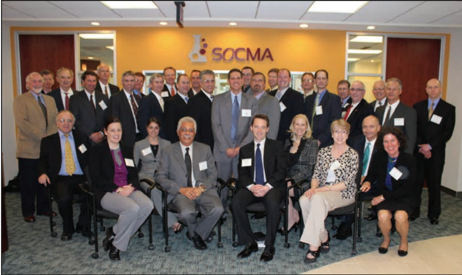
SOCMA members pose for a group shot during the opening session of the Fly-In.