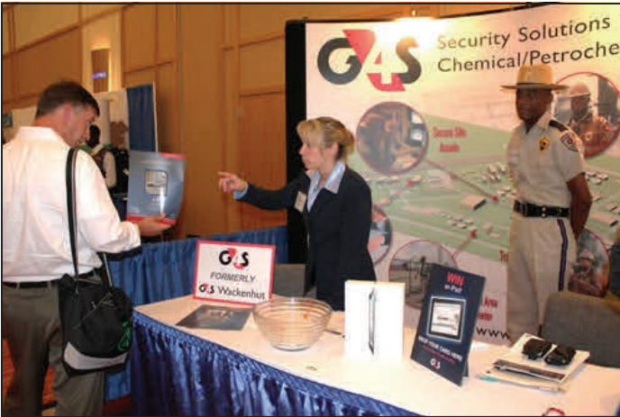
SOCMA member G4S at the expo hall.

More than 700 attended this year's Chemical Sector Security Summit.