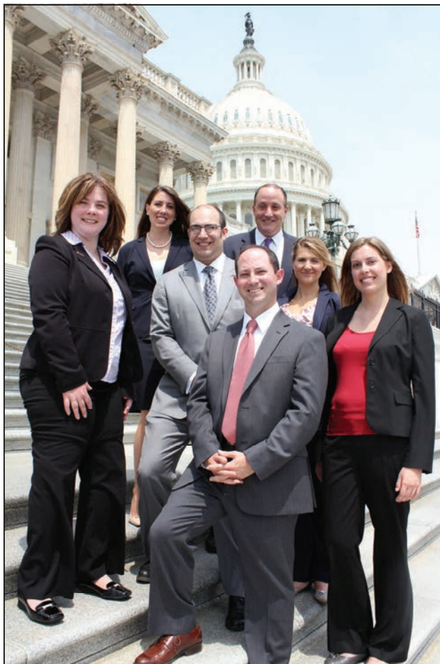
SOCMA's Government Relations Team on Capitol Hill