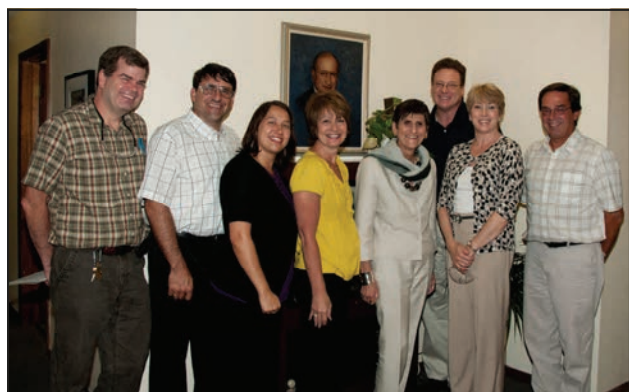
Congresswoman Rosa DeLauro visits Hampford Research, Inc.

In April, SOCMA members strengthened their influence on Capitol Hill at SOCMA CONNECT's Fourth Annual Washington Fly-In. This year's event attracted nearly 40 SOCMA members (almost 25% more than last year's event) who collectively met with some 80 Congressional offices (50% more than last year's event). The Washington Fly-In provided an excellent opportunity for SOCMA members to educate members of Congress and their staff about how legislative issues are affecting the chemical manufacturing industry. SOCMA members discussed Chemical Facility Anti-Terrorism Standards (CFATS), the Toxic Substances Control Act (TSCA), regulatory review, the R&D tax credit, the pending free trade agreements with Panama, Columbia, and Korea, duty suspensions, drug safety, and climate change. For many SOCMA members, this was a chance to start a dialogue with their elected officials, ensuring that their members of Con-