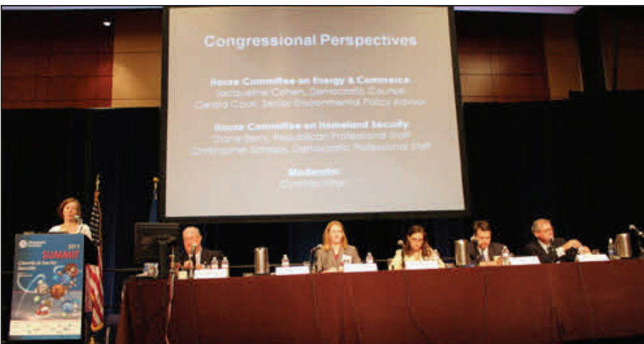
Congressional staff, representing both Democratic and Republican members of Congress, discussed current and future legislation affecting the chemical industry.