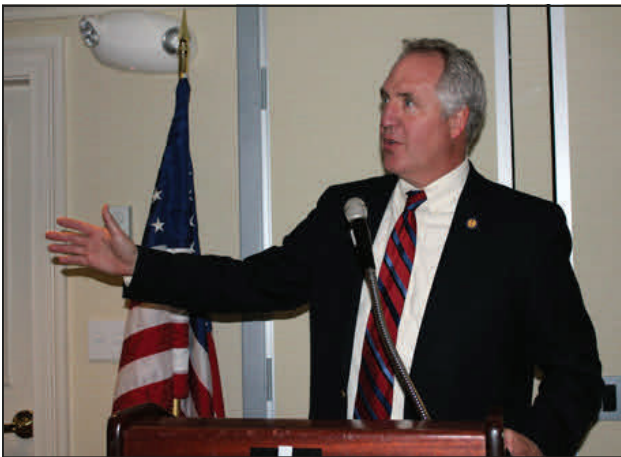
Congressman John Shimkus (R-IL) speaks to SOCMA members at the Capitol Hill Club in Washington.